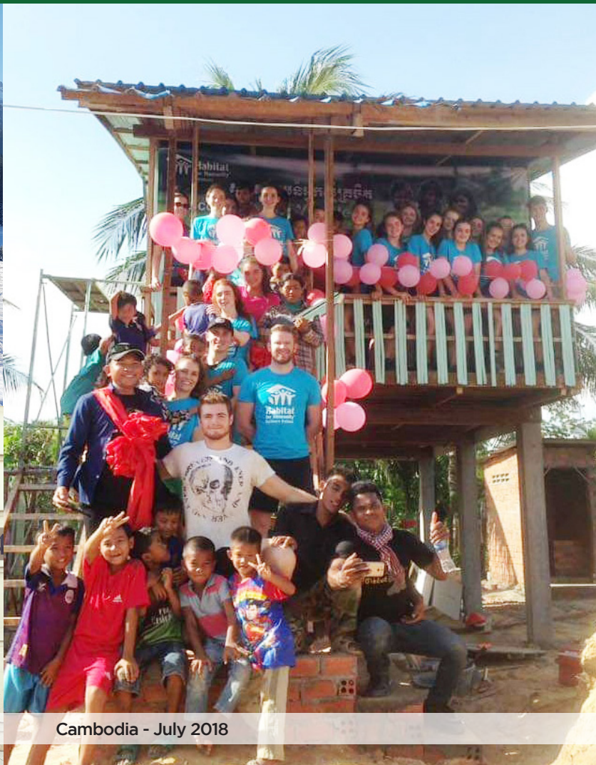
Cambodia - July 2018