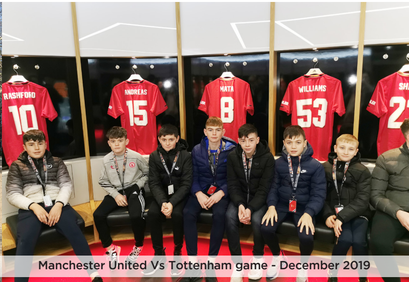
Manchester United Vs Tottenham game - December 2019