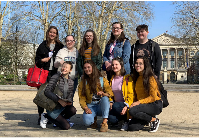
Belgium - September 2018