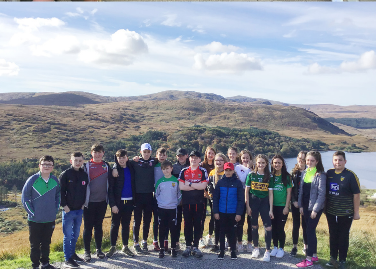
Gaeltach - July 2019