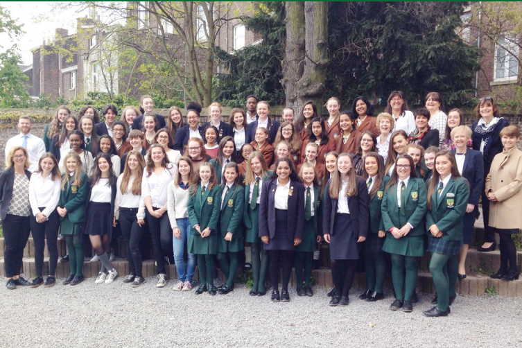
Belgium - September 2018