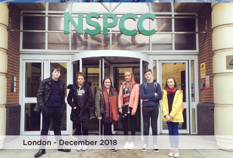
London - December 2018