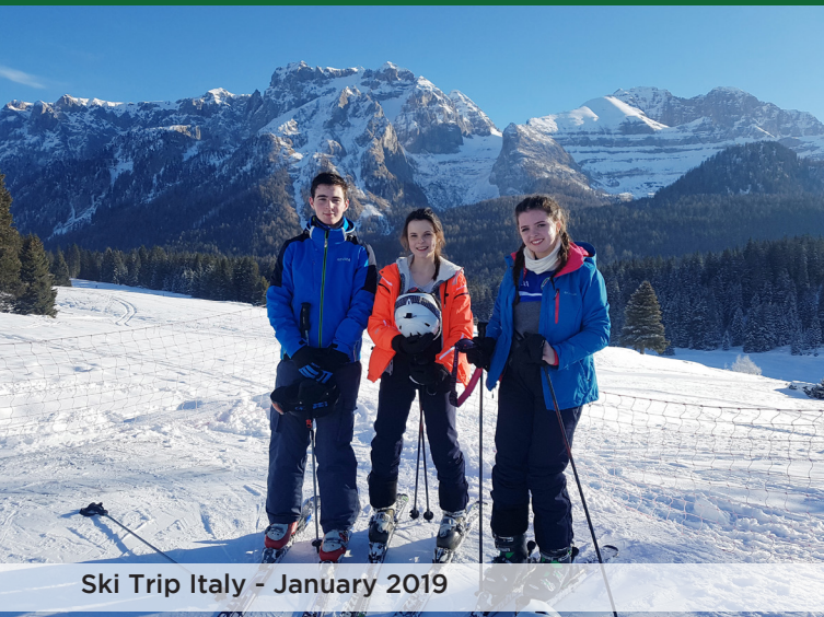
Ski Trip Italy - January 2019