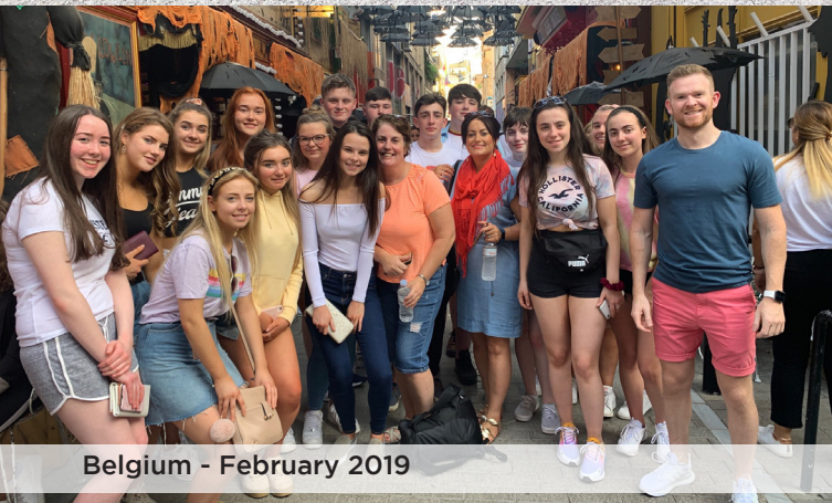
Belgium - February 2019