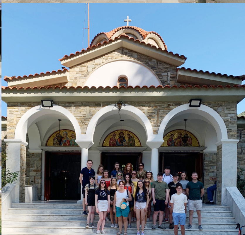
Athens - October 2019